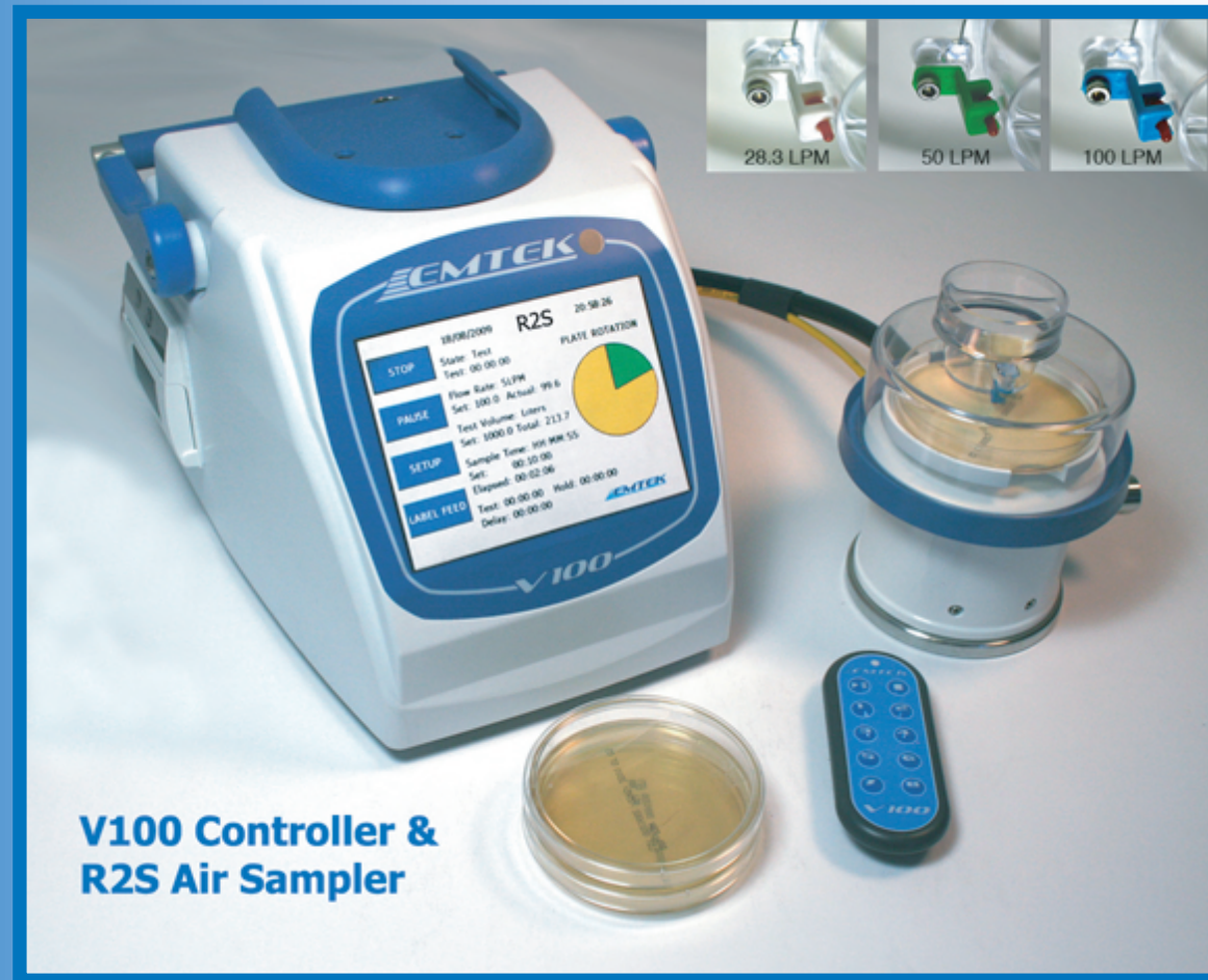
V100 Controller & R2S Air Sampler