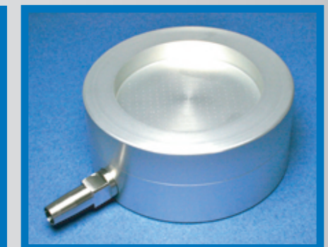
28.3 LPM (Clear)