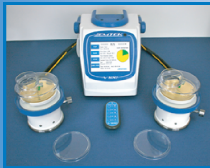
V100 & R2S Dual @ 50 LPM

The V100 can operate two (2) R2S or RAS samplers at the same time at a sampling rates of 50 LPM, and four (4) R2S or RAS samplers at 28.3 LPM. Ask your sales representative for details.