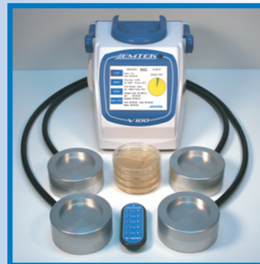
V100 & 4 x RAS @ 28.3 LPM