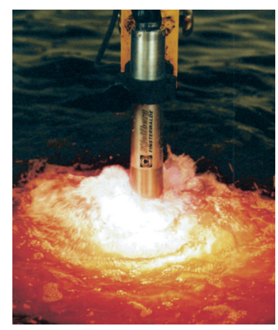
Underwater plasma cutting with FineFocus 800 / 1600