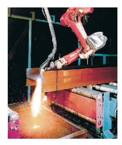
Plasma Cutting in combination with a robot with FineFocus 450 / 800