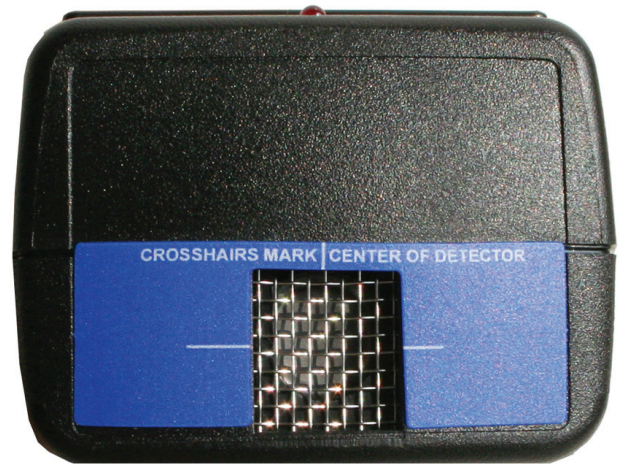
The end window of the M4 and M4EC

Dual miniature jack drives CMOS or TTL devices: count to computer or datalogger. Submini jack input allows for electronic calibration. USB versions of the M4 and M4EC have a mini-USB jack for use with the USB Observer Software.