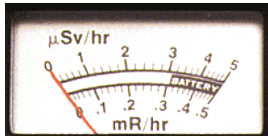
Optional SI Meter Scale: 0-500 µSv/hr & 0-50 mR/hr