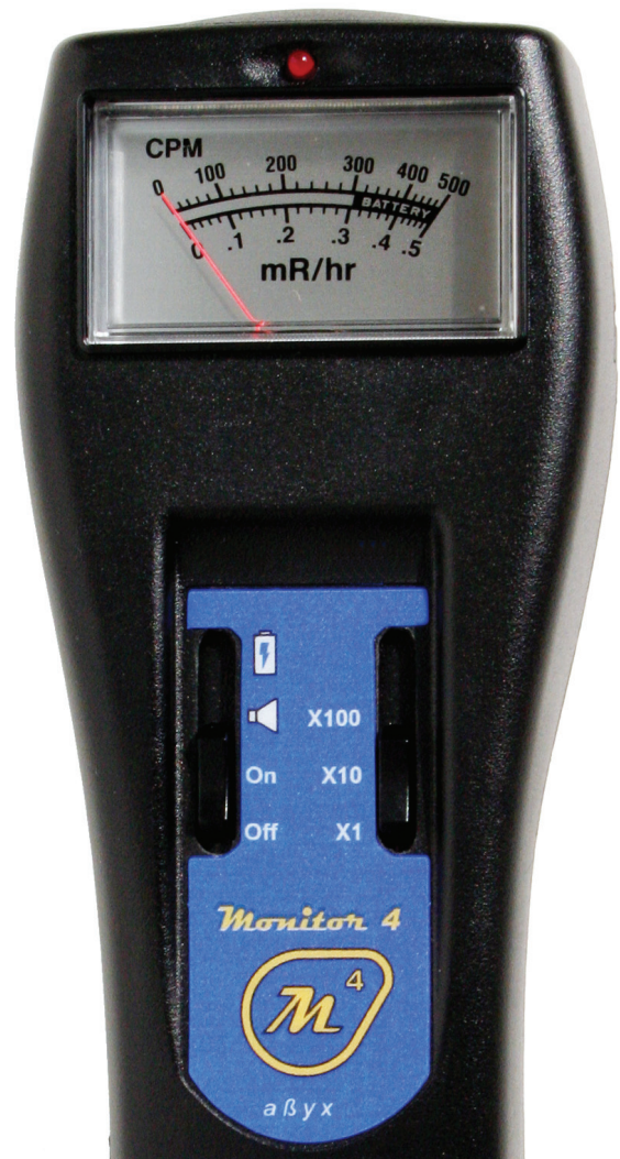
M4 with CPM & mR/hr meter scale

Analog Meter holds full scale in fields as high as 100X maximum reading. CPM & mR/hr scale. Optional SI Scale Meter Available